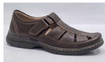
MODEL: BONDY 02