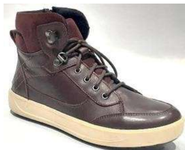
MODEL: DENIZE 13