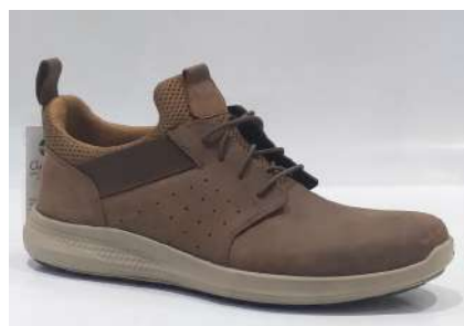
MODEL: KINLEY 05