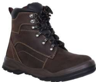
MODEL: BEN 36