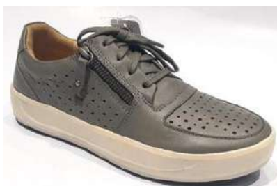
MODEL: DENIZE 03